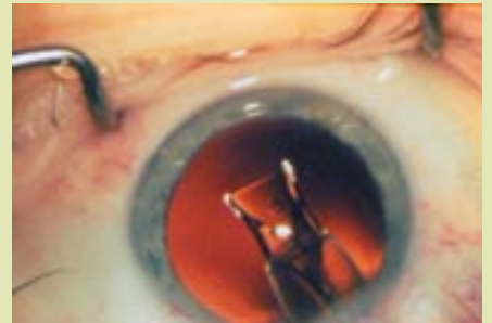
Implantation of soft foldable toric IOL to correct astigmatism.

keratectomy (PRK), or just under the corneal surface, laser-assisted sub-epithelial keratectomy (LASEK), or under a half-thickness corneal flap, laser-assisted in-situ keratomileusis (LASIK).